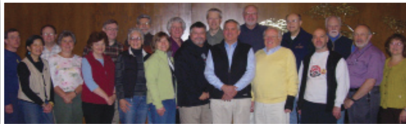
The UDECC Board of Trustees

promise individually for the good of the whole will help us see where God is leading us. Our ecumenical vision has developed a life of its own, and with everyone's full-hearted participation it will continue to seek the form it needs in order to become reality.