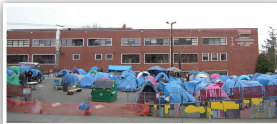
Nickelsville at University Congregational Church's Parking Lot, February 28, 2009